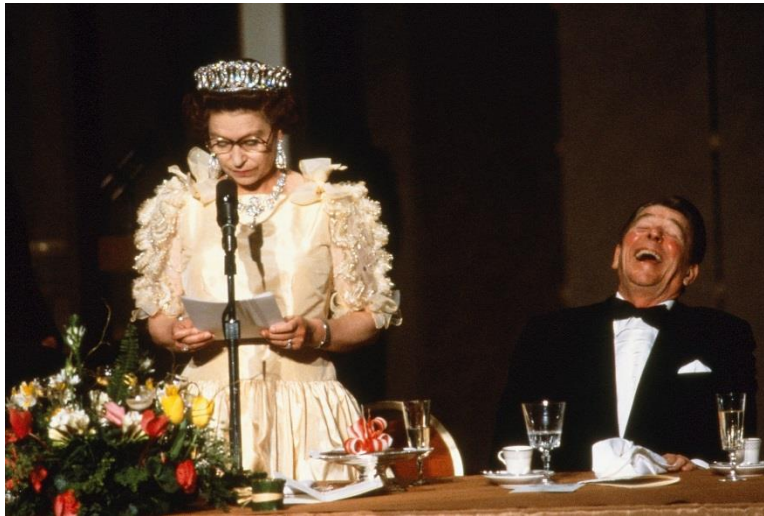
President Ronald Reagan laughs at a joke told by Queen Elizabeth II at a state dinner held in her honor at the M.H. de Young Museum in San Francisco, California, on March 3, 1983.

On view June 23 - August 7, 2016 Opening Reception and Panel Discussion on Thursday, June 23, 5:00 – 7:00 pm